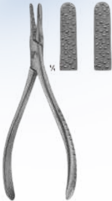
MES-23-202 Nail extracting forceps 135 mm