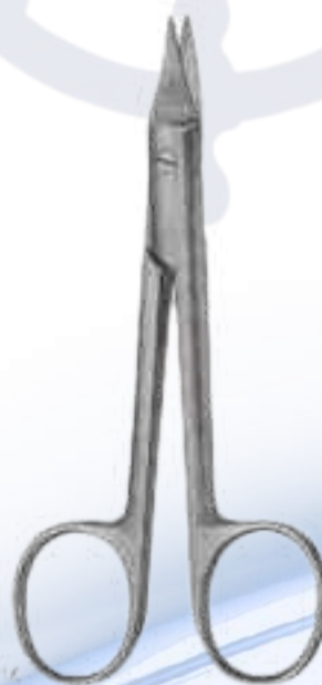
MES-23-208 SYSTRUNK Scissors, for splitting finger nails 130 mm