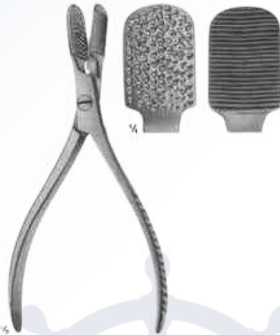
MES-23-203 Nail extracting forceps 145mm