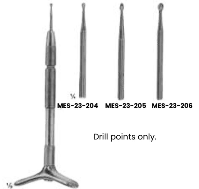
MES-23-204 - 206 Finger nail drill with 3 points