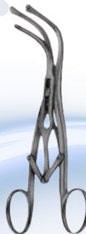
MES-16-178 LABORDE strong pattren 135mm