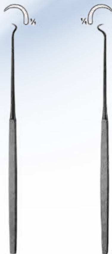
MES-16-169 BOSE 165 mm