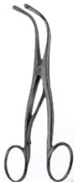
MES-16-176 TROUSSEAU 120 mm