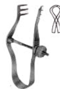
MES-16-175 FINSEN 70 mm