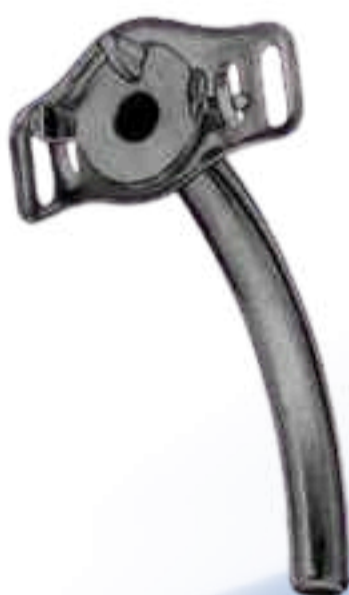
MES-16-149 - 158 JACKSON German Silver