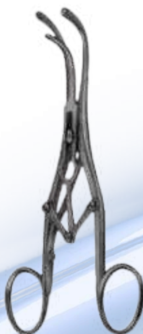
MES-16-177 LABORDE 125 mm