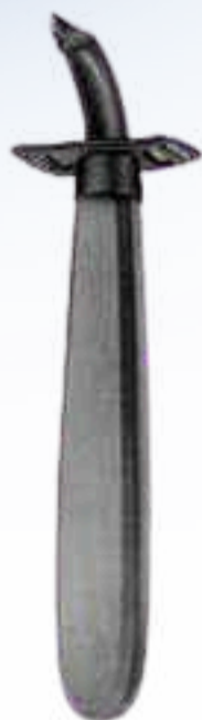
MES-16-137 UECKERMANN-DENKER Cryothyreotomy trocar with silver cannula 130mm