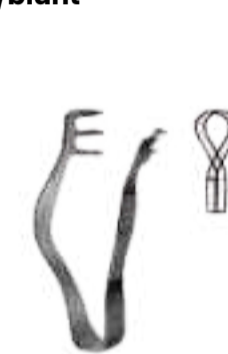
MES-16-174 FINSEN 50 mm